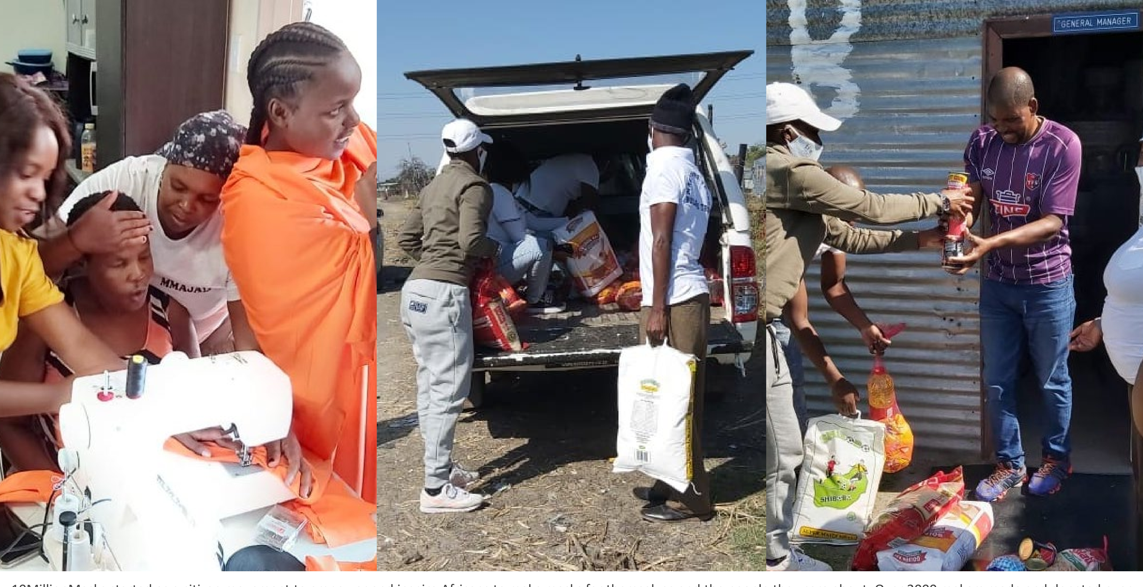
10MillionMasks started as a citizen movement to empower and inspire Africans to make masks for themselves and the people they care about. Over 2000 makers made and donated over 220 000 masks, and we are tremendously proud of that achievement. We worked in autonomous distributed cells, using guidelines and sharing ideas, and scaled from zero to 2000 in three weeks. Now, there are five of us left – and we are reimaging our future.